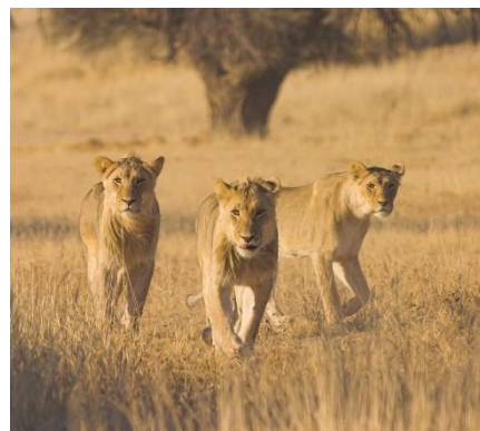
These young lions are learning how to hunt.

Lion cubs inherit the physical traits they need to be hunters. They have claws and sharp teeth to help them catch and bite their prey. Their tan fur helps them blend into their grassy environment. They have good vision and an excellent sense of smell. But when lion cubs are born, they do not know how to hunt. Hunting is an example of a learned behavior. Cubs have to learn how to hunt by watching their parents. They may even “hunt” each other as practice when they are cubs. It takes months for lion cubs to learn how to use their inherited traits to help them catch and kill food.